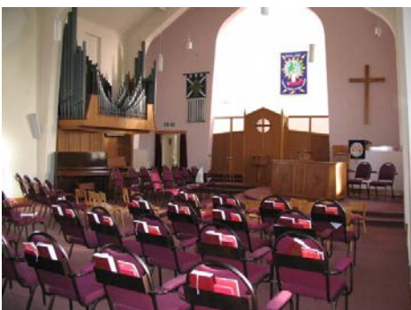
Church set up for Sunday worship