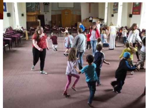
As well as our halls and meeting rooms the church can also be used as a flexible space