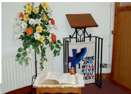
Quiet space in the church for prayer and meditation